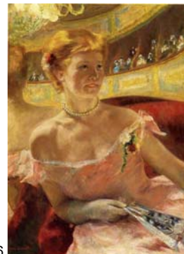
6. Mary Cassatt (1844-1926) Woman with a Pearl Necklace in a Loge , 1879 Oil on canvas, 81.3 x 59.7 cm Philadelphia Museum of Art