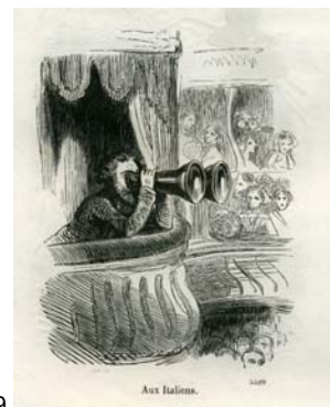
9. 'Stop' (Louis Morel-Retz) (1825-99) Aux Italiens (At the Italian Theatre) Caricature from Le Petit Journal pour Rire , 1857 The Courtauld Gallery, London

These images are available for editorial purposes only from: