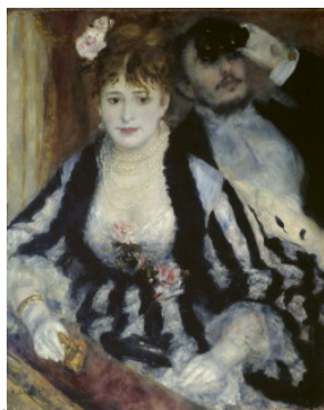
1. Pierre-Auguste Renoir (1841-1919) La Loge (The Theatre Box) , 1874 Oil on canvas, 80 x 63.5 cm The Courtauld Gallery, London