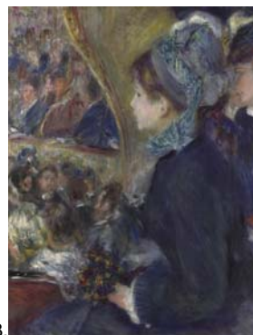
3. Pierre-Auguste Renoir (1841-1919) At the Theatre , c. 1876-77 Oil on canvas, 65 x 49.5 cm National Gallery, London