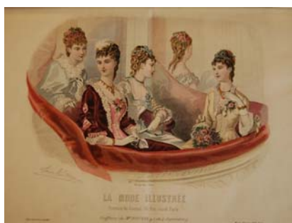
8. Anais Toudouze (1822-99) Fashion plate from La Mode Illustrée , 1879 Hand-coloured engraving 28.3 x 36.2 cm The Courtauld Gallery, London