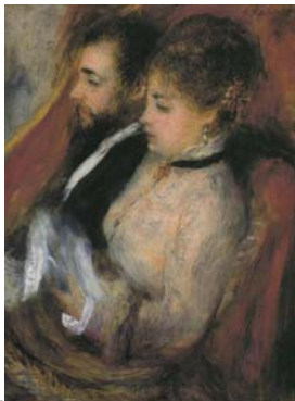
2. Pierre-Auguste Renoir (1841-1919) La Petite Loge , c. 1873-4 Oil on canvas, 27 x 20.7 cm Museum Langmatt, Stiftung Sidney und Jenny Brown, Baden