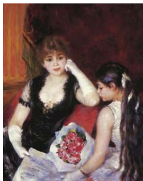
4. Pierre-Auguste Renoir (1841-1919) At the Concert , 1880 Oil on canvas, 99 x 80 cm The Sterling and Francine Clark Art Institute, Williamstown