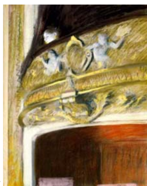
7. Edgar Degas (1839-1917) La Loge , 1880 Pastel on paper laid on board 66 x 53 cm Private collection, courtesy of Christie's, New York