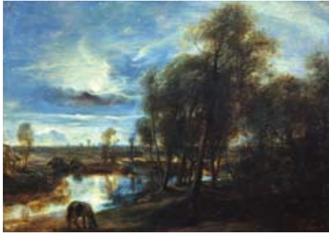
Peter Paul Rubens, Landscape by Moonlight, c1635-40