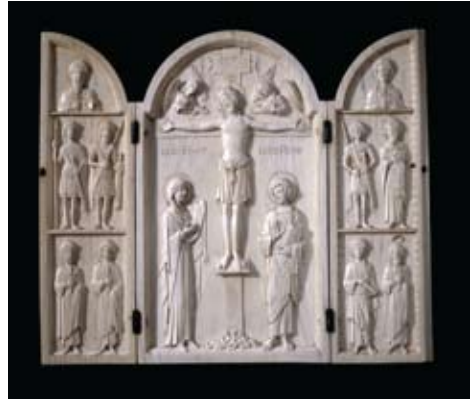
Borradaile Triptych

Dr Antony Eastmond, Reader in the History of Byzantine Art at The Courtauld – whose post is funded by your donations this year – will give a tour of the newly opened medieval gallery at the British Museum which displays objects from Europe 1000 – 1500. Dr Antony Eastmond will introduce the new displays and discuss what can be learnt about the medieval world through these objects.