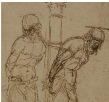
Andrea Mantegna, Studies for Christ at the Column (detail), c1460