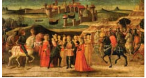
The Master of Marradi, The Reconciliation of the Romans and the Sabines (detail), c. 1470-80. By kind permission of the Earl and Countess of Harewood and the Trustees of the Harewood House Trust

TUESDAY 24 MARCH, 8.00 – 9.45AM The Courtauld Gallery For: Patrons' Circle and Director's Circle