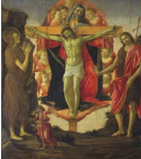
Botticelli, Holy Trinity with Saint John the Baptist, Mary Magdalene, Tobias and the Angel, 1490-1495